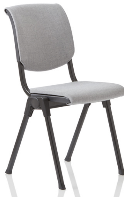
Design: Peter Opsvik Patent- and design protected